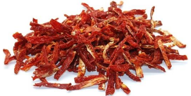
Julienne cut (strips)

Packing: Bulk: 10 kg Plastic Bag: 0,5 kg – 5 kg