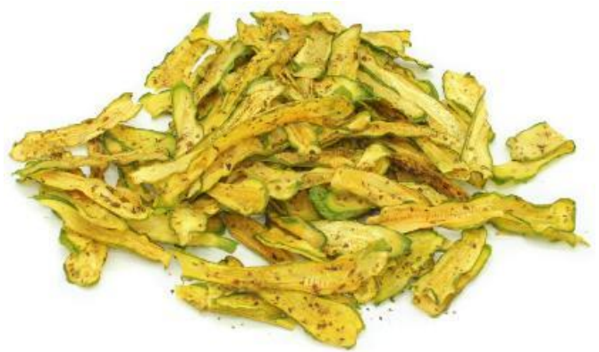
Long slice cut – Marinated

5x5 / 8x8 / 10x10 / 12x12 mm dice cut available > 4 / 2 – 4 / <2 mm granule available