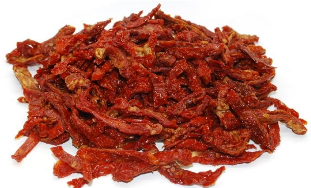
Julienne cut (strips)

Packing: Bulk: 10 kg Plastic Bag: 0,5 kg – 5 kg