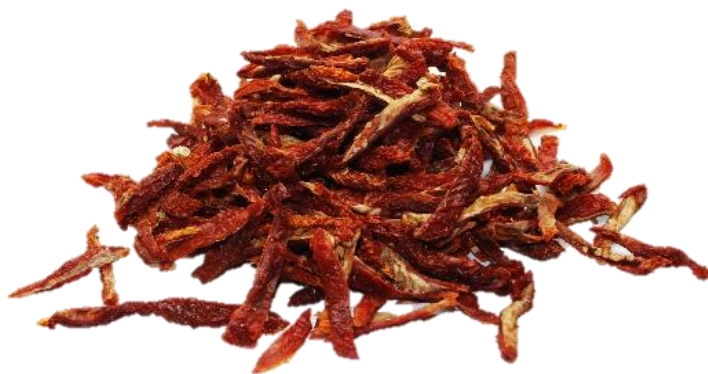
Julienne cut (strips)

Packing: Bulk: 10 kg Plastic Bag: 0,5 kg – 5 kg